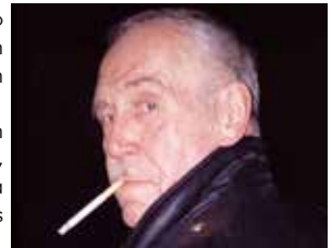
Photo of Tom

The exhibition presents a multidimensional person. It is an exhibition about Tom of Finland as a man: as young man, soldier, musician, AD, brother, friend, artist, old man suffering from emphysema – and as a marvelous writer. His exhaustive correspondence covers seven decades from the early 1940s to the year of his passing in 1991.